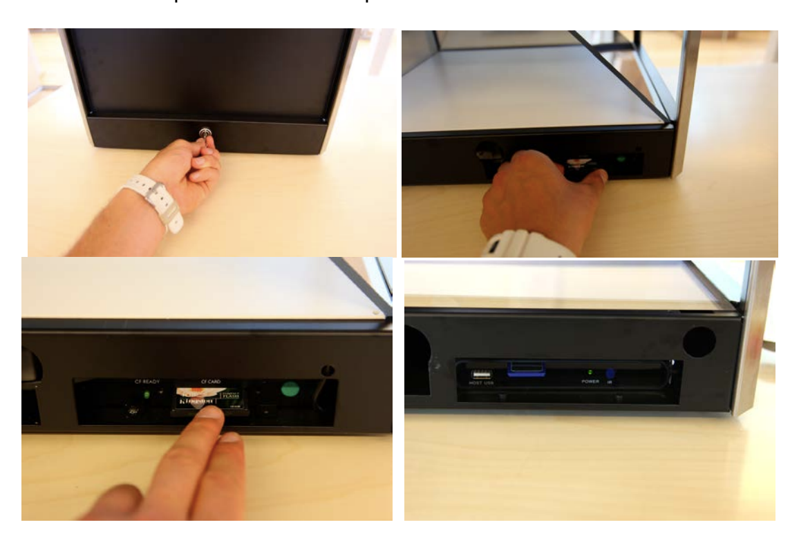
NOTE: The type of player and memory card can vary based on standard or high feature specifications.

NOTE: We recommend keeping a backup copy of your Dreamoc content, either on a computer or on a backup SD card.