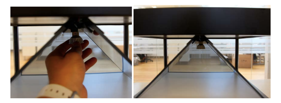
OPTIONAL : The Dreamoc Scandinavia 180 has a standard MR11 socket for G4 LED lamps, which makes it easy to change the light to smoother/brighter LED lamps or change the color of the light, by replacing the original LED lamp.

Insert the new lamp and refit the metal spring securely.