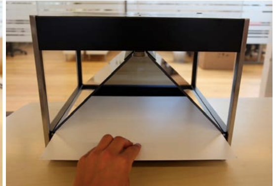
OPTIONAL: A black bottom plate can be purchased as an accessory.